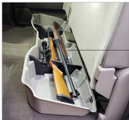
2 shotguns or rifles, 1 with scopes, will fit in the gun rack, as pictured.

Warning: Seat bottom must be down at all times while vehicle is moving. Make sure the DU-HA is secured in the vehicle according to installation instructions. Do not store explosives or hazardous materials in the DU-HA. Do not place loaded guns in the DU-HA. For further instructions refer to truck owners manual or contact DU-HA, Inc.