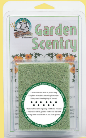
GS-1 GARDEN SCENTRY