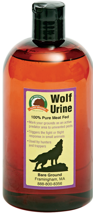
16 oz. WU-16