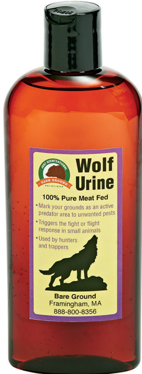
8 oz. WU-8