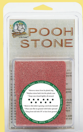
PS-1 POOH STONE DOG TRAINING DEVICE