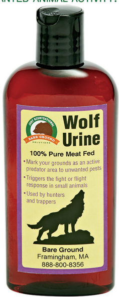
4 oz. WU-4