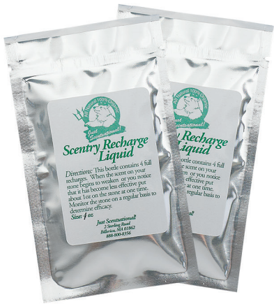
2 oz. WU-2