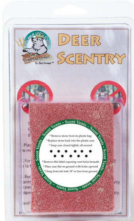
DS-1 DEER SCENTRY