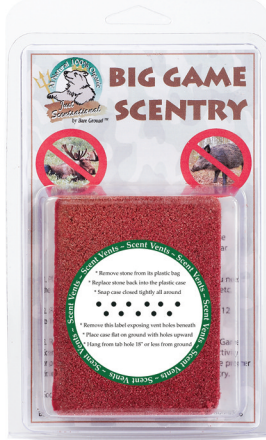
BGS-1 BIG GAME SCENTRY