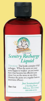
RC-1 SCENTRY RECHARGE LIQUID