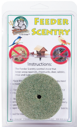
FS-1 FEEDER SCENTRY