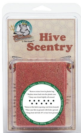
HS-1 HIVE SCENTRY