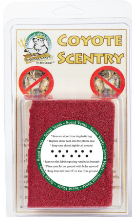
COYS-1 COYOTE SCENTRY