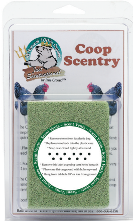
CS-1 COOP SCENTRY