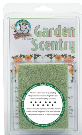
GS-1 GARDEN SCENTRY