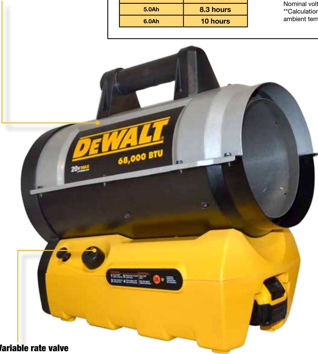
Variable rate valve

Electrostatic powder-coat finish ensures long life and protection for internal components