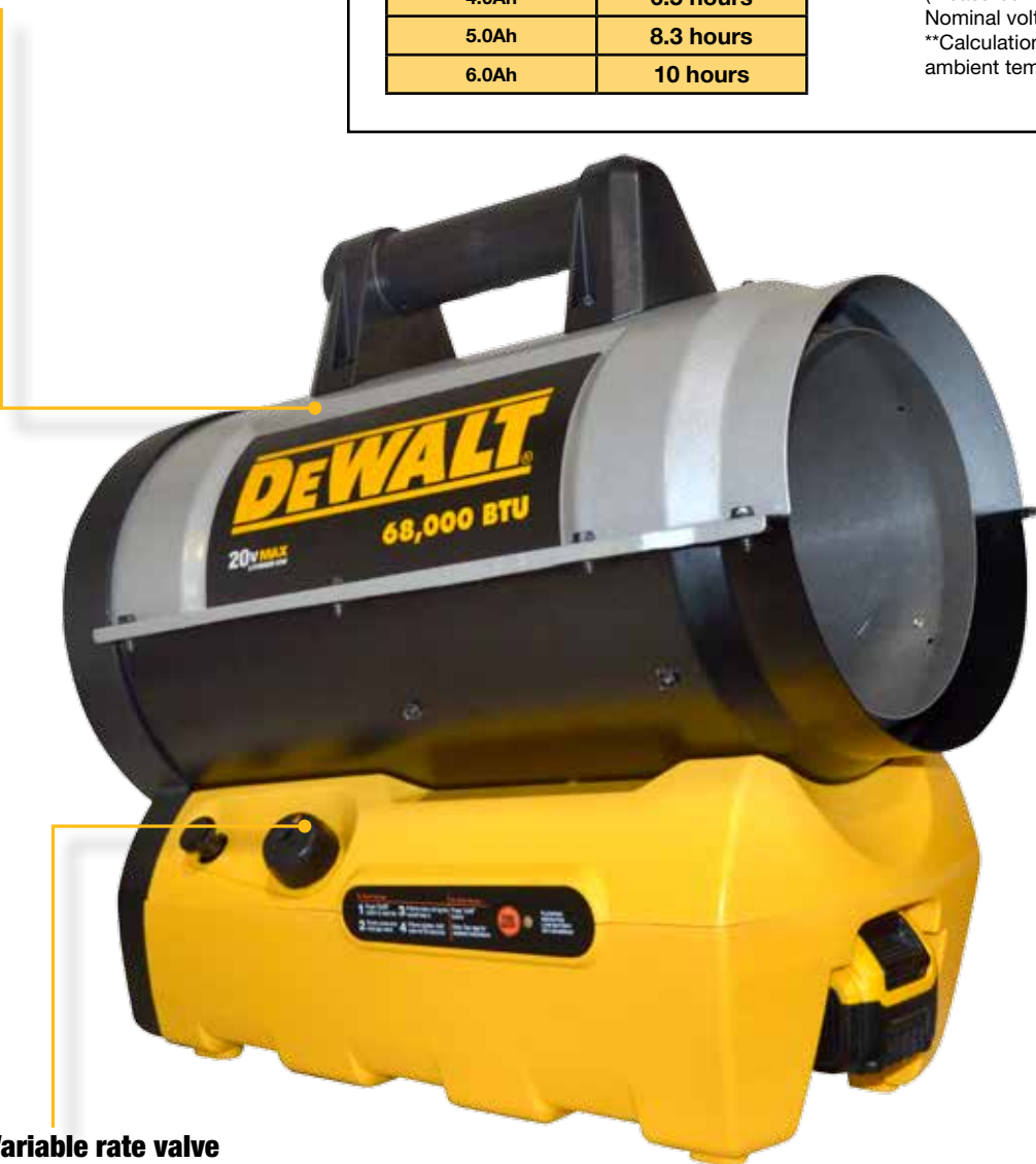
Variable rate valve

Electrostatic powder-coat finish ensures long life and protection for internal components