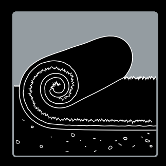
PROMOTES BETTER CONTACT BETWEEN SOIL AND NEWLY LAID SOD OR GRASS SEED