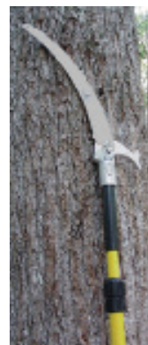
TP-12-S and TP-14-S Sawhead Permanently Mounted On Pole