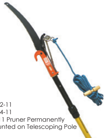
TP-12-11 TP-14-11 PH-11 Pruner Permanently Mounted on Telescoping Pole

For safety, Jameson does not recommend attaching additional poles or Big Shot to Telescoping Poles.