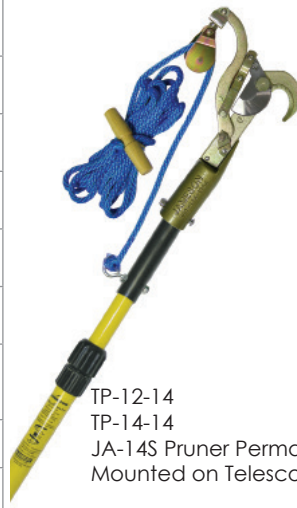
TP-12-14 TP-14-14 JA-14S Pruner Permanently Mounted on Telescoping Pole