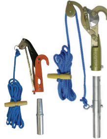
Pruners With Adapters Snap Into Pole's Female Ferrule