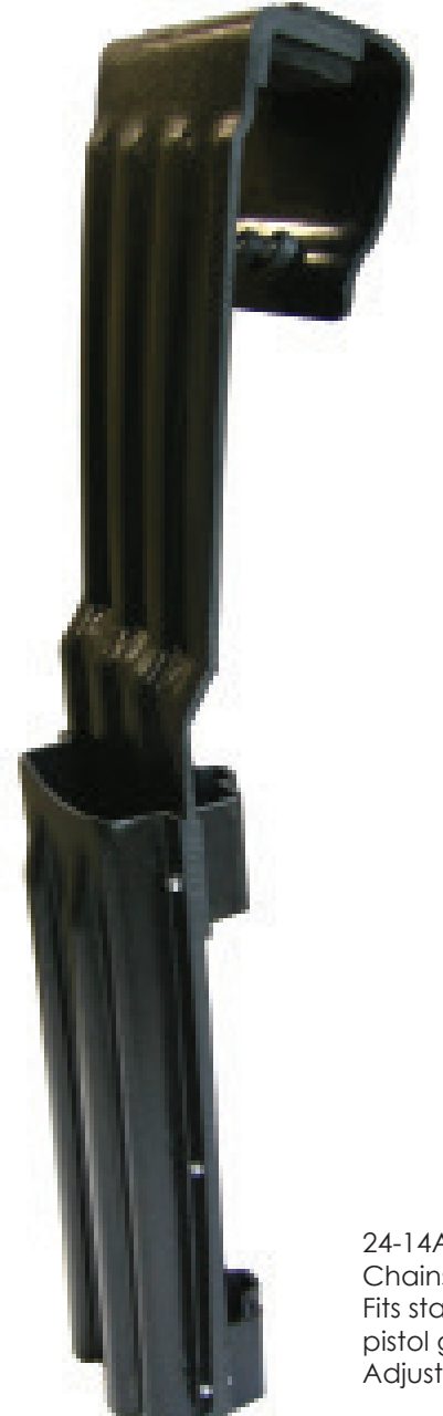
24-14A Chainsaw Scabbard Fits standard and hydraulic pistol grip chainsaws. Adjustable clamp bracket.

Jameson's heavy duty bucket and boom mount tool holders are water repellent and UV resistant to withstand extreme weather conditions.