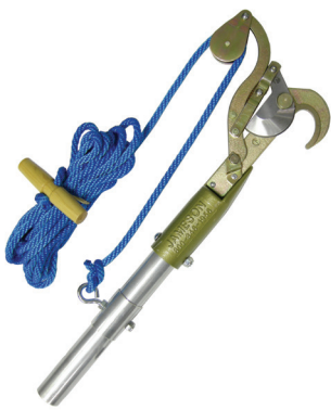
JA-14 Fixed Pulley Pruner 1.25" cut capacity (Shown with Pole Adapter)

Jameson's heavy duty JA-14 Pruners were designed for the professional arborist. Forged steel construction for added strength, an enhanced spring for smoother cutting action and a raised leading edge on hook eliminates frictional drag. 1.25" side cut.