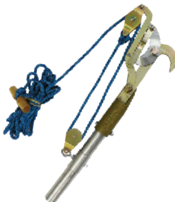
JA-34 DP Double Pulley Big Mouth Pruner Double pulley allows for additional leverage and significantly reduces pulling force required. (Adapter Included)