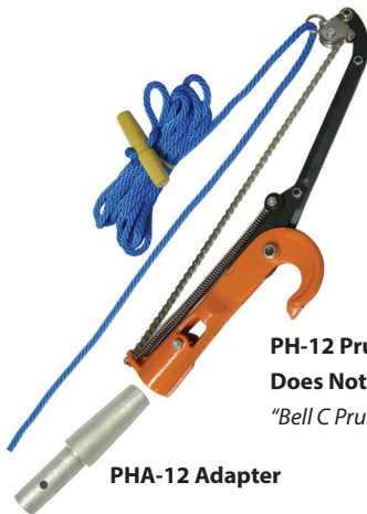
PH-12 Pruner with 1.5" Center Cut Does Not Accommodate Saw Blade "Bell C Pruner"