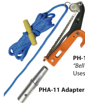
PH-11 Pruner with 1" Center Cut "Bell B Pruner" Uses SB-1T or SB-2 Saw Blade