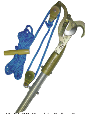
JA-14 DP Double Pulley Pruner Double pulley allows for additional leverage and significantly reduces pulling force required (Adapter Included)