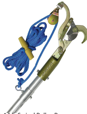
JA-14 S Swivel Pulley Pruner Swivel provides versatility in pull direction and more leverage with less pressure on pulley arm (Shown with Pole Adapter)