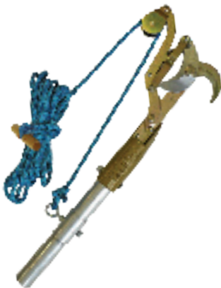
JA-34 Big Mouth 1.75" Cut Pruner Largest cutting capacity pruner (Shown with Pole Adapter)