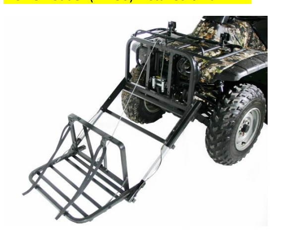
PLUT1 Adapter Bracket (only) below for Ranger