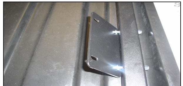
FIG. 4A (OUTSIDE MOUNT)