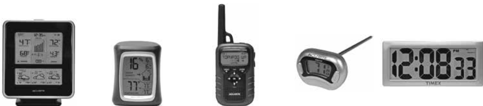
Weather Stations Temperature & Humidity Weather Alert Radio Kitchen Thermometers & Timers Clocks