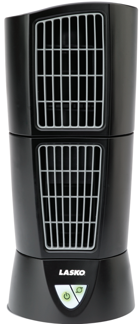
Front-Mounted Electronic Controls