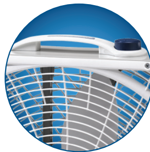
Top Mounted Controls and Easy-Carry Handle