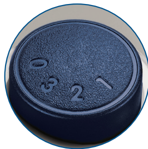
3 Energy-Efficient Speeds