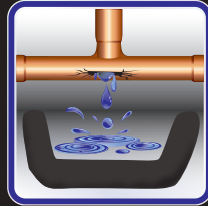
INDOOR WATER CONTROL