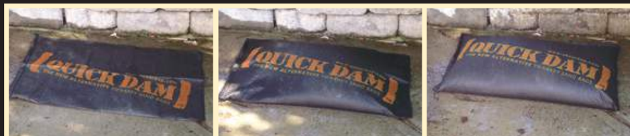
Activates & grows when wet

[QUICK DAM] THE NEXT GENERATION IN FLOOD PROTECTION™