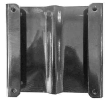
2 pieces 8 x 8 inch dolly