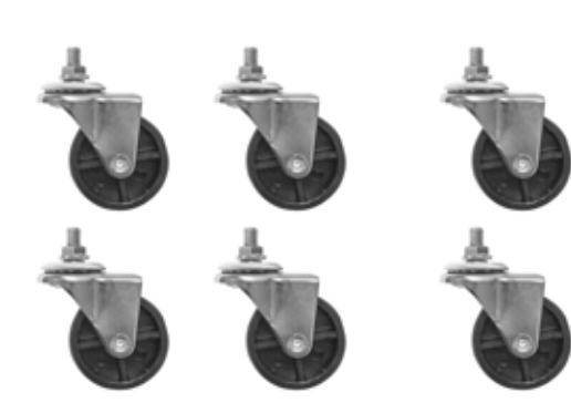
12 pieces total swivel casters