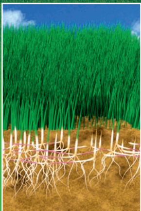
Water Saver ® with RTF ®