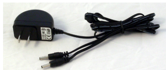
ET-1 Dual Charger

(The charger has two plugs, one to charge the collar and one to charge the transmitter.)