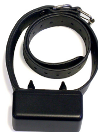
Rechargeable Receiver Collar