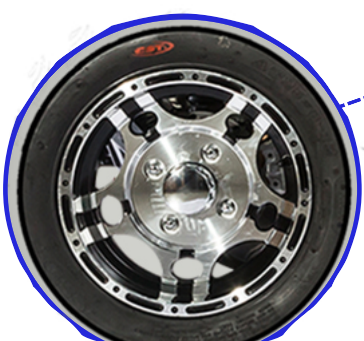
ALUMINUM ALLOY WHEELS WITH CST TIRES