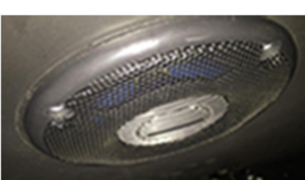
FRONT LEFT SPEAKER