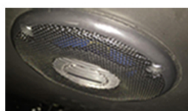
FRONT RIGHT SPEAKER