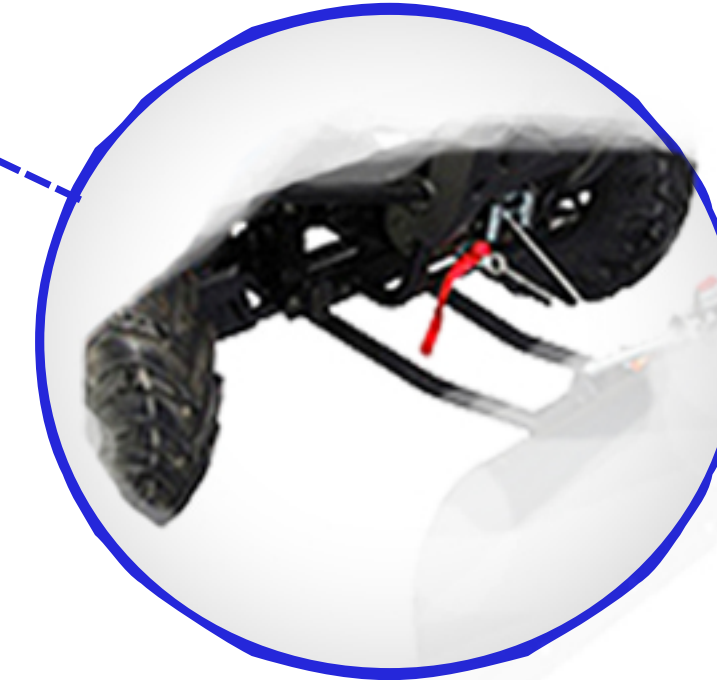
SNOW PLOW ATTACHMENT