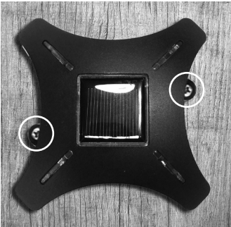
Mounted on a vertical surface