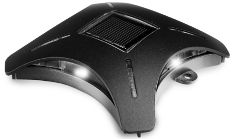
Placed flat on a horizontal surface