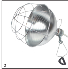
2. Finish all 6 holes