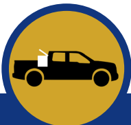
TOOL BOX COMBOS