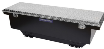
70-GALLON REFUELING TANK COMBO PART NO.: 080-01-16230