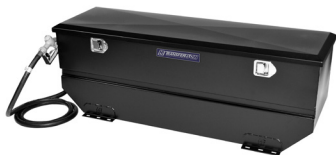
40-GALLON REFUELING TANK COMBO PART NO.: 080-01-15195