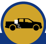
IN-BED FUEL TANKS