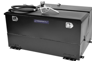
100-GALLON REFUELING TANK COMBO PART NO.: 080-01-15457