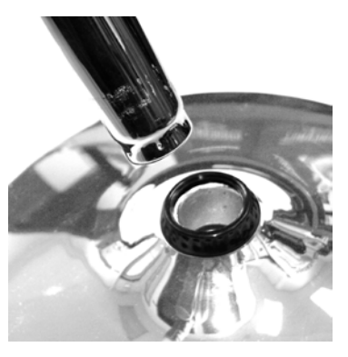
Place the wide end of the Support Cylinder into the center hole.