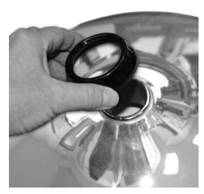
Place the Foot Cap over the center hole on the base plate.