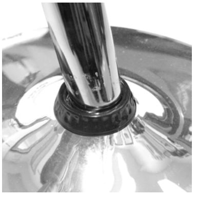
Press the Support Cylinder down firmly into the center hole.