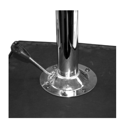
Use the allen wrench to attach the Seat Plate to the underside of the Seat with the provided bolts.