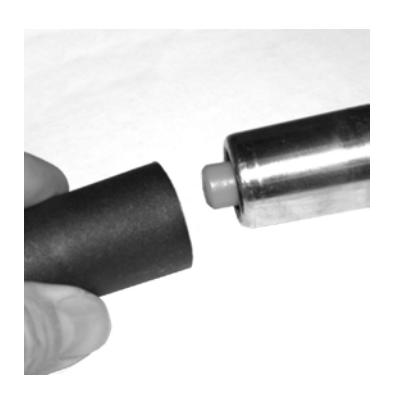
Remove the Black Cap and discard it before assembly. The Orange hydraulic button will become visible.