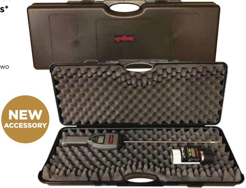
* Testers shown in Hard Shell Carry Case are NOT included