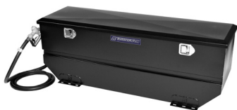
40-GALLON REFUELING TANK COMBO PART NO.: 080-01-15195