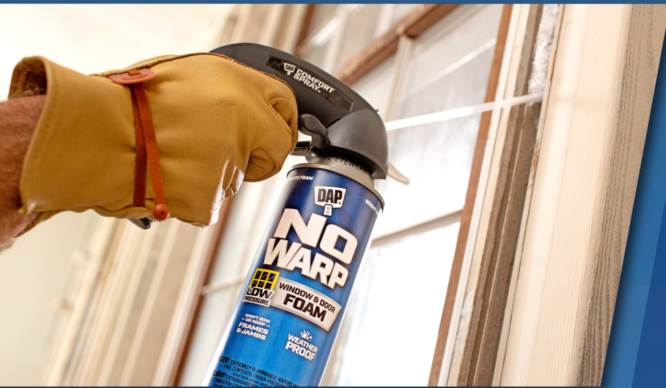
Shown with DAP® Comfort Spray™ Universal 1-Component Straw Foam Applicator (sold separately, product # 7565070230).

No Warp® is specially formulated for use around window and door frames. While it can be used as an all-purpose foam, this revolutionary expanding polyurethane foam is designed to air seal without exerting pressure that can be detrimental to window or door frame stability. The end result is an air-tight seal, without bowing windows and doors, that lowers energy costs.