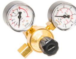
Regulator CAT# 85662