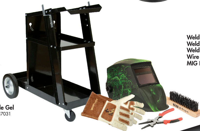
Welding Carts Welding Helmets Welding Gloves Wire Brushes MIG Pliers

SEE OUR FULL LINE OF METALWORKING ACCESSORIES