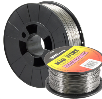
Flux Core MIG Wire CAT# 42300 - .030" 2 Lb. CAT# 42301 - .030" 10 Lb.