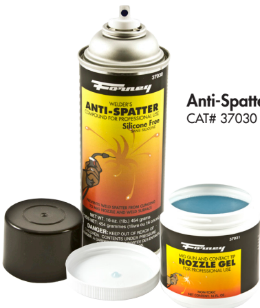
Anti-Spatter Spray CAT# 37030