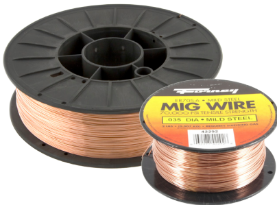
Mild Steel MIG Wire CAT# 42290 - .023" 2 Lb. CAT# 42291 - .030" 2 Lb. CAT# 42285 - .023" 10 Lb. CAT# 42286 - .030" 10 Lb.