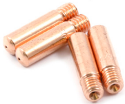
Contact Tips (4 Pack) CAT# 60170 - .023" CAT# 60171 - .030"