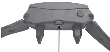
Engaged (tab is in)

Battery life is extended if you disengage the battery when it is not being used. To do this squeeze together the two finger tabs on each side of the battery pack and pull it out of the casing about 3/16 inch. Friction will retain the battery in the disengaged position as shown here.