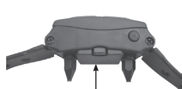
Insert Battery in Back of Collar