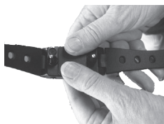
Press Battery Firmly Until Flush With Back