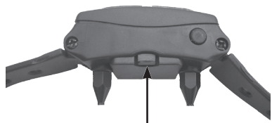
Disengaged (tab is out)

When the battery is disengaged, pressing the TEST button will produce no tone or status lights.