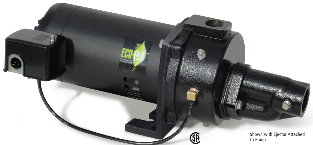
Shown with Ejector Attached to Pump