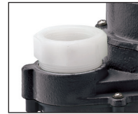
*2" MNPT x 1-1/2" FNPT Adapter Included