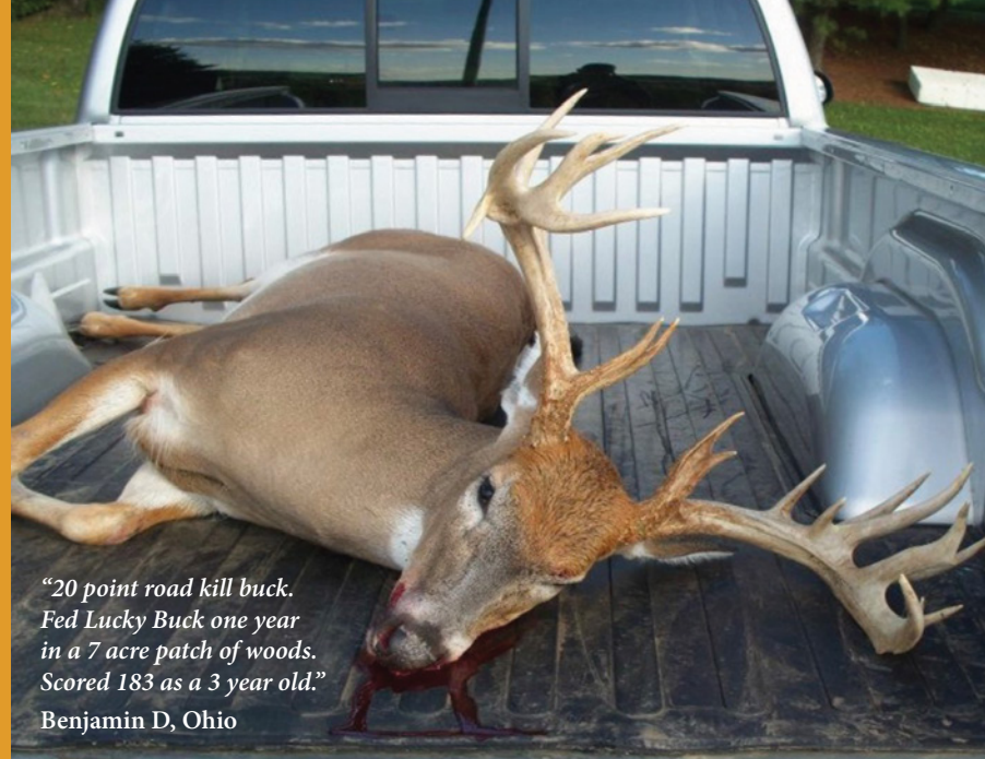
"20 point road kill buck. Fed Lucky Buck one year in a 7 acre patch of woods. Scored 183 as a 3 year old." Benjamin D, Ohio

"We've been using Lucky Buck on our farm for 3 years and can tell the difference in the antlers and body size of our deer. They have a lot more mass than neighboring farms' deer. We took our deer to our local taxidermist and it was interesting to see the difference in the antler mass of our deer compared to the other deer in our area." Cheyenne D., Missouri