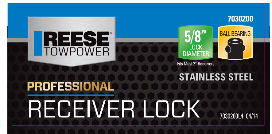
TRAY LABEL Permanent Adhesive Laminated

WARNING • Make sure pin is fully inserted into lock body before depressing lock button to the locked position. Check that the lock components are secure. • After installation, position lock to allow proper chain attachment. • Failure to properly lock this receiver could cause damage to property, injury or death. 7030200L5 04/14