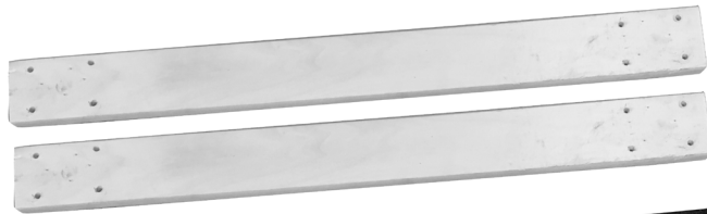
2 Long Pieces