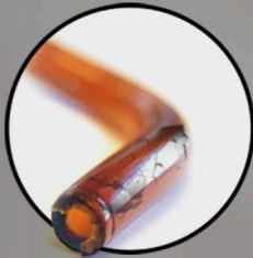
FUEL LINE EXPOSED TO ETHANOL

In addition to drying out and cracking rubber and plastic engine parts, ethanol is the culprit in a process that worsens over time and can destroy your equipment.