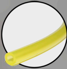
REGULAR FUEL LINE