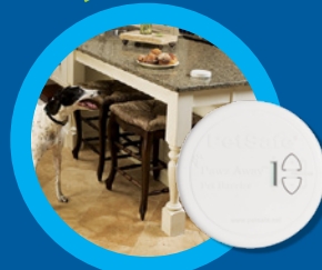
Pawz Away Indoor Pet Barrier

CONTAIN your pets AND HELP them AVOID special areas around your home