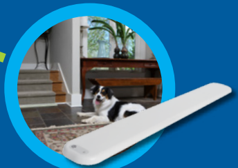
Pawz Away Threshold Pet Barrier