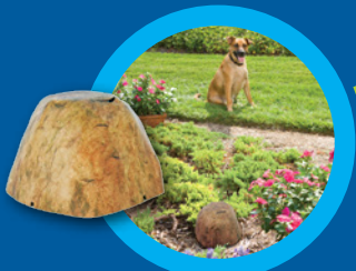
Pawz Away Outdoor Pet Barrier

Works Seamlessly with Pawz Away Barriers