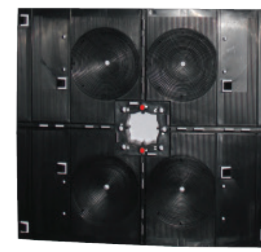
• 2 Floors