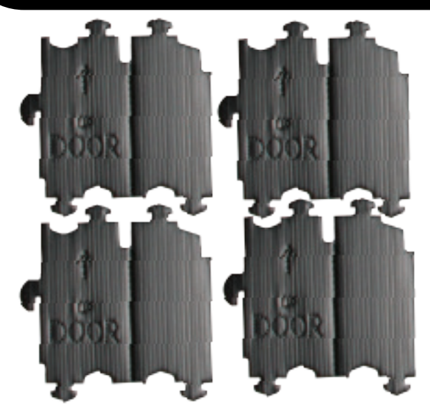
• 4 Door Dividers