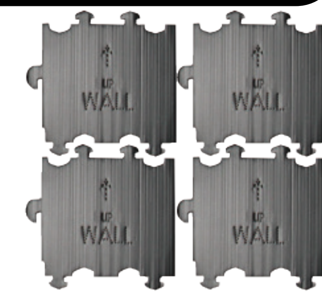
4 Wall Dividers