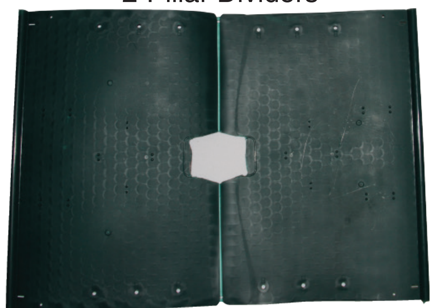
• 1 Roof