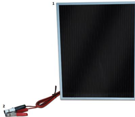
Diagram and Parts List