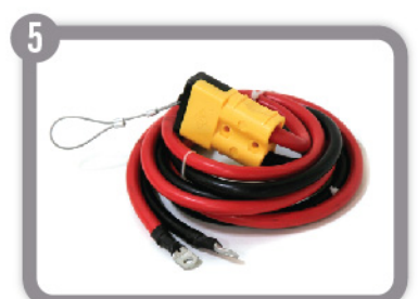
6 ft. Battery Lead