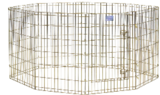
Gold Zinc with Door

Sturdy Framed Door Allows for Convenient Step-Through Access