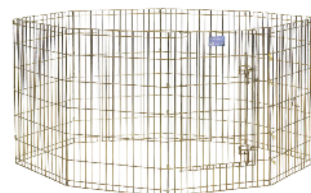
Gold Zinc with Door

Sturdy Framed Door Allows for Convenient Step-Through Access