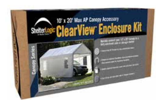
Hi Impact Wrap Label Packaging

CLEARVIEW® WINDOWS - enhanced visibility clear polyethylene windows.