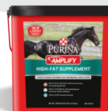
NET WT. 30 lb (13.61 kg)