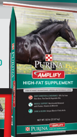
NET WT. 50 lb (22.68 kg)