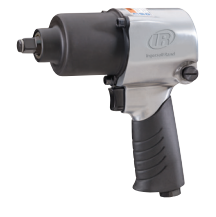
231G Impact Wrench