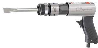
114GQC Quick Change Air Hammer