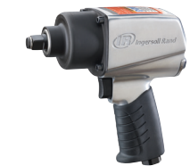
236G Impact Wrench