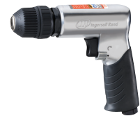
7811G Reversible Air Drill

The EDGE Series™ makes it easy to conquer the task in front of you. Whether cutting, drilling, or hammering, you know you can count on Ingersoll Rand's EDGE Series™ to help you get the job done!