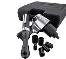
2317G Impact/Ratchet Kit