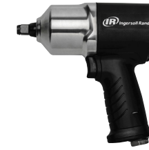
EB2125X Impact Wrench