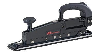
315G Straight Line Sander