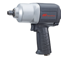
2100G Impact Wrench