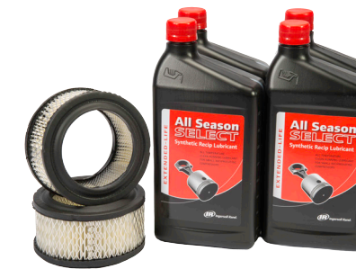
2340L5-V Start-Up Kit for 2340 Model Compressors Contents: All Season Product Data (1); Air Filter Element (1); Decal (1); All Season Select Lubricant (4)