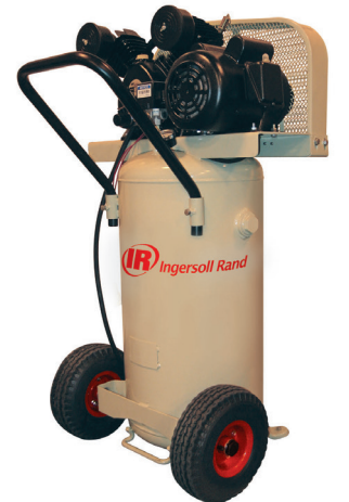
P1.5IU-A9 Garage Mate Reciprocating Air Compressor