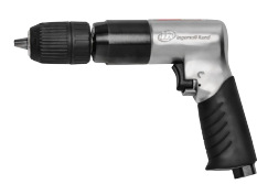
EC112 Air Drill