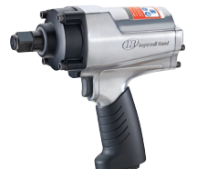
259G Impact Wrench