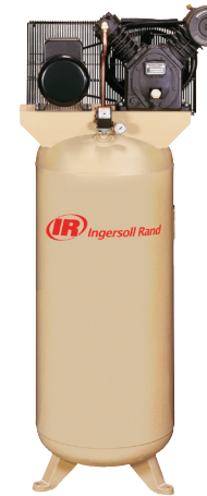
2340L5-V Type 30 Reciprocating Air Compressor