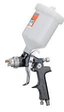
210G Spray Gun