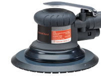
300G Random Orbital Sander