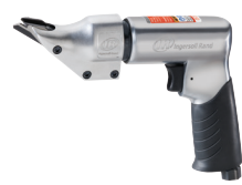
7812G Air Shear