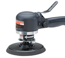
311G Dual Action Sander