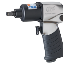
215G Impact Wrench

With Ingersoll Rand's proven engineering expertise behind them, the EDGE Series™ Impact Wrenches and Ratchets deliver rugged reliability and power in a durable, compact package.