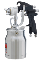
210CSA Spray Gun