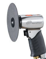
317G High Speed Sander