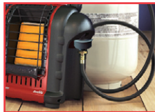
Optional Hoses And Fuel Filter Fuel filter prevents contaminants from entering heater.

Model No. MH9BX Stock No. F232000 4,000/9,000 BTU/HR Gas: Propane Operating Position: Vertical Valve Positions: Off, Pilot, Lo, & Hi Heating Time: 1lb. Cylinder: 3 to 6 hours 20lb. Cylinder: 48 to 110 hours Product Dimensions: 13.4"W X 15"H X 7.7"D Folded Dimensions: 13.4"W X 13.3"H X 7.7"D Shipping Weight: 9.5lbs. UPC Code: 089301320000 UPC Code Canada: 089301320505 UPC Code California: 089301320253