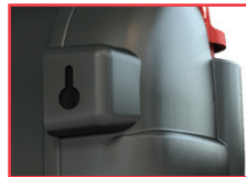
Key Shaped Mounting Holes For Easy Wall Mounting