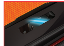
Low-Oxygen Safety Shut-Off System

Not designed for permanent installation or for use above 7,000 feet.