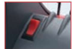
Blower Fan On/Off Switch